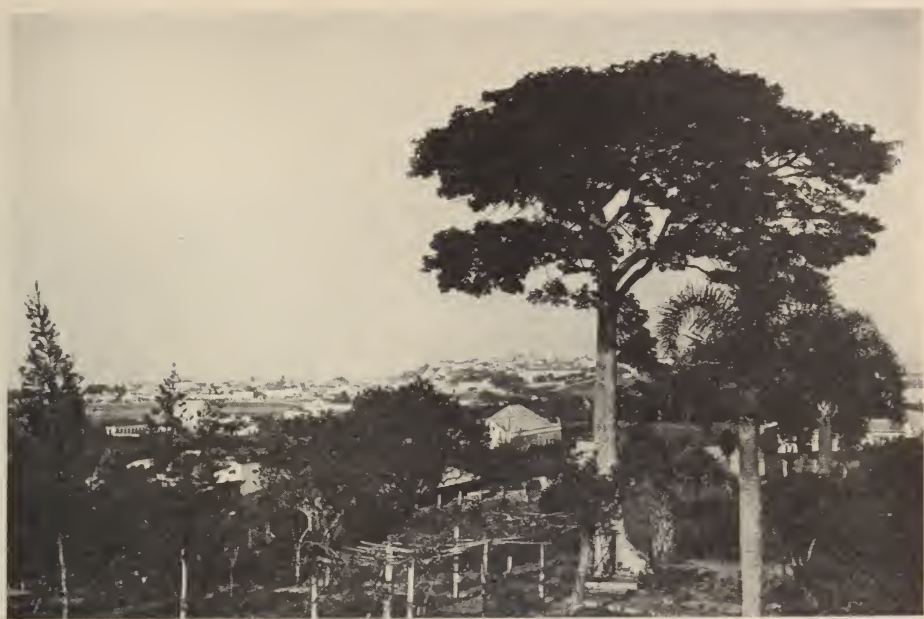
GENERAL VIEW OF PORTO ALEGRE

on the sciences in accord with national school schedules. All instruction is given in Portuguese, and modern languages are taught so that the boys can speak them. More stress is laid on English and French than on other languages. French is required for entrance into any of the higher institutions. The textbooks have been chosen with great care and the course is second to none in the state.